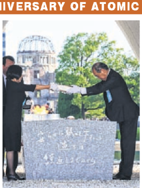
Hiroshima Mayor Kazumi Matsui (R) at the Peace Memorial Park in Hiroshima

The leaders issued a joint statement calling for the continued non-use of nuclear weapons, but they also justified having such arms to "serve defensive purposes, deter aggression and prevent war and coercion." "Leaders