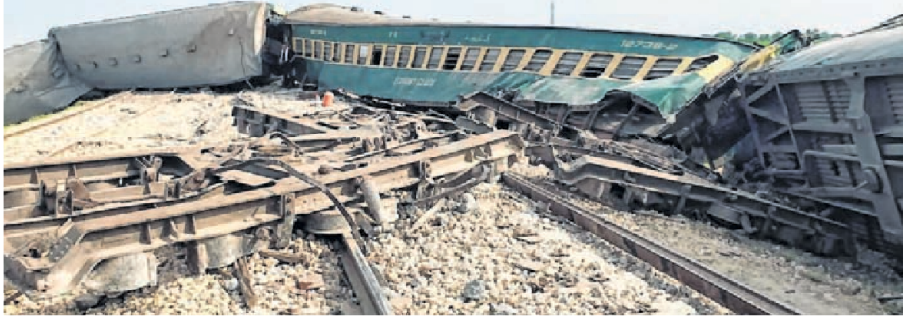
Damaged carriages are pictured following the derailment of a passenger train in Nawabshah

Rejection of the court's decision by PTI and legal fraternity has heightened political tensions as Pak gears up for upcoming polls